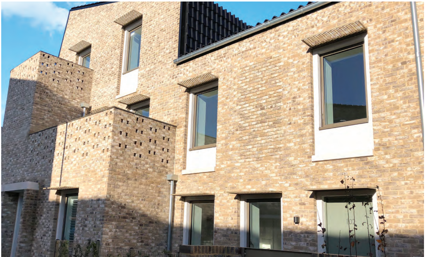
Crest's Belgravia Buff Multi and Grosvenor Grey Multi bricks.

This beautiful high-quality clay roof tile was a perfect match for this special project which echos the scale and street pattern of the local Victorian housing and traditional materials of brick and tile, yet detailed in a simple and contemporary way.